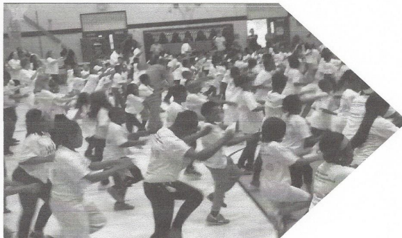
↑ Hickey Elementary School students dancing at the 1st Annual Let's Move! Move Your Body Flash Mob in May 2015.